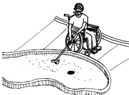
Accessible Routes Adjacent to Playing Surfaces

All areas within holes where golf balls rest shall be within 36 inches maximum of a clear floor or ground space 36 inches wide minimum and 48 inches long minimum having a running slope not steeper than 1:20. The clear floor or ground space shall be served by an accessible route.